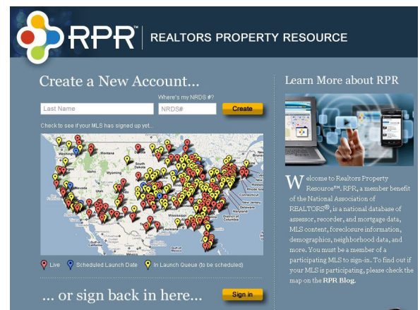
Generate reports with the info your clients crave.